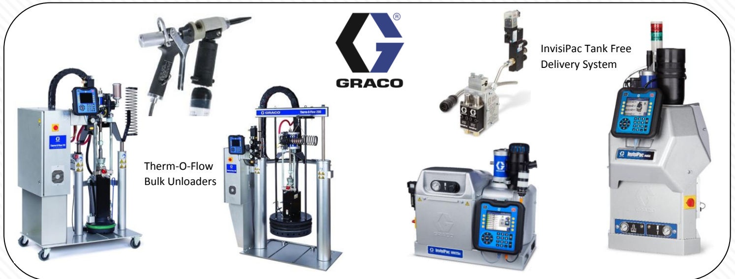
Therm-O-Flow Bulk Unloaders